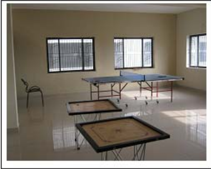
Table Tennis, Carrom, Chess etc.